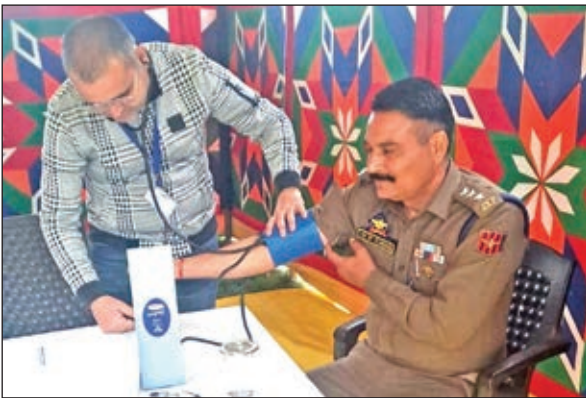
An officer being checked up during the camp.

JAMMU: A medical camp for the official check-up for all officers /officials was organized at JKAP 8th Battalion Headquarters at Miran Sahib in collaboration with BMO R.S Pura. The aim of said initiative was to assess the medical conditions of the unit police personnel at regular intervals. In the said camp Commandant JKAP 8th Battalion personally underwent medical check-up along with other Gazetted officers. He emphasized the importance of such health camps, stating that personnel in uniformed services often find difficult to undergo regular medical check-ups due to their duties. Said camp was also organized with the aim to find out one stop solution for monitoring the health of officers/officials. 208 police