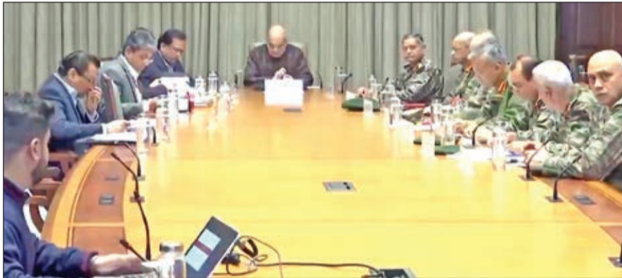
Union Home Minister, Amit Shah chairing security review meeting at New Delhi on Tuesday.

Jammu and Kashmir Lieutenant Governor Manoj Sinha, DGP Nalin Prabhakar, Army chief General Upendra Dwivedi