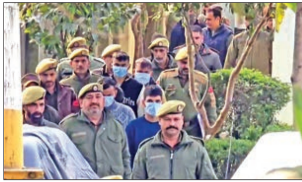
Nowabad Police taking gangsters to court on Tuesday.