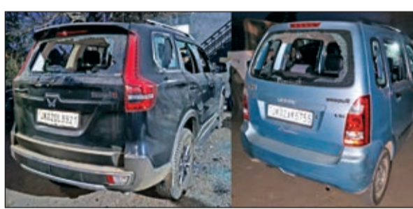
Vehicles damaged by miscreants at Phallian Mandal.