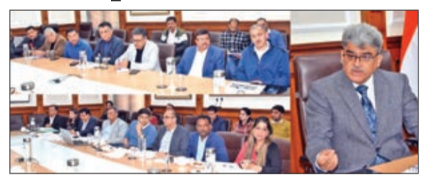
CS Atal Dulloo chairing a meeting in Jammu.

Those who attended the meeting included Principal Secretary, Finance; Commissioner Secretary, Tourism; Secretary, PWD; CEO, SMVDSB; DC, Jammu; DC, Reasi; MD,