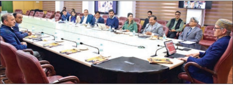
Chief Minister Omar Abdullah chairing a meeting at Jammu on Friday.

Omar Abdullah appreciated the initiative, emphasizing that the marathon should receive widespread publicity