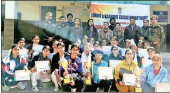
Excise Dept officials with winner teams and faculty.