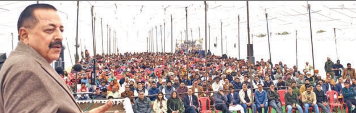
Union Minister Dr. Jitendra Singh addressing a public rally after inaugurating Multiple Water Supply schemes under Jal Jeevan Mission at Jasrota, Kathua on Saturday.