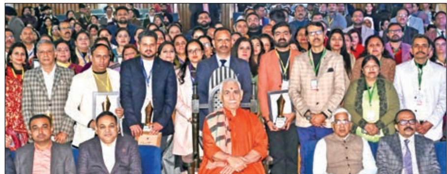
LG Manoj Sinha at the Inspirational Teachers Award Ceremony in Jammu.