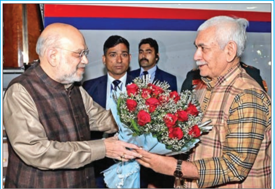
LG Manoj Sinha welcoming Home Minister Amit Shah on his arrival at Jammu Airport on Thursday late night.