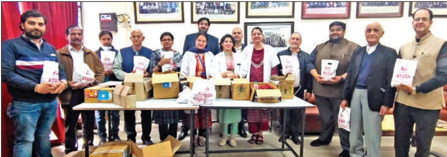
Members of Tax Bar Association Jammu distributing immunity booster kits during a camp.