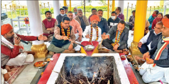
Dharmarth Trust members performing Hawan.