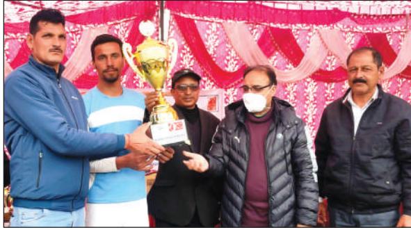
Chief Guest presenting trophy to winner team.