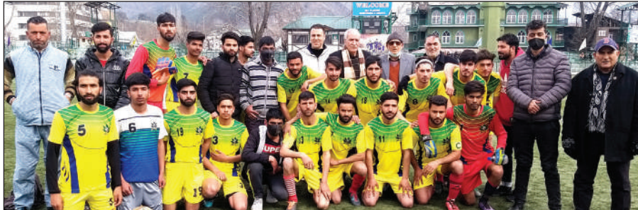
Football team posing for a photograph with officials.

JAMMU: Stopped due to snowfall, the first phase of the 29th Annual Football Championship resumed today at Synthetic Turf TRC Srinagar under the banner of J&K Football Association (JKFA).