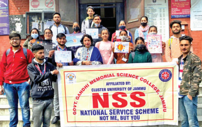
NSS volunteers of GGM Science College posing with faculty members.

JAMMU: Various educational institutions celebrated National Science Day on Monday by organizing seminars and discussions on the scientific contributions of Nobel Laureate C V Raman. Raman had discovered the famous 'Raman