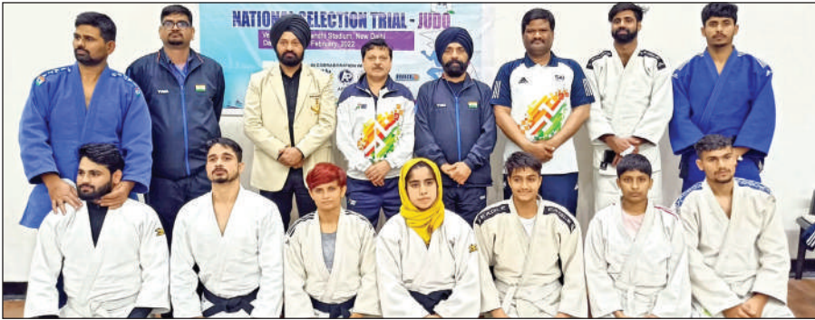
8-member Indian Team selected for 24th Deaflympic with Selectors at I G Stadium, New Delhi.