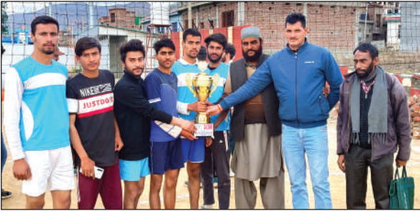
Chief Guest presenting trophy to a winner team.

The event was organised by NYC. Earlier, in the semifinals, Banyia Club defeated Stadium Club 3-2 (25:21, 25:19,21:25,23:25,18:16) while Choudhary Club trounced Budhal Volleyball Club 3-0 (25:08, 25:10,25:20. Additional District Development Commissioner Rajouri was the chief guest while Manager Sports