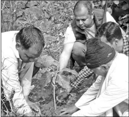
Faculty members planting a sapling.