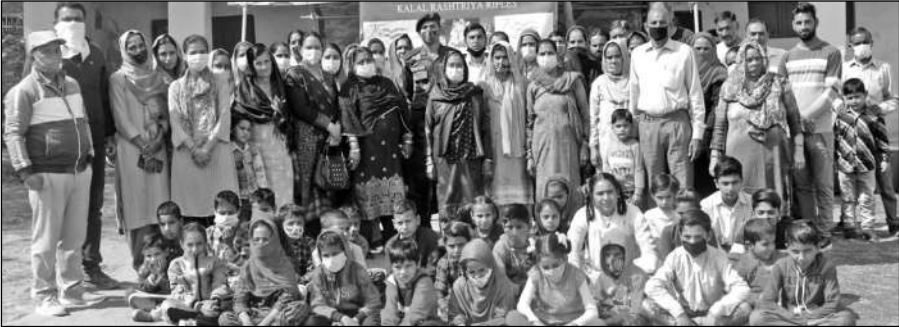
Army officials along with locals and students during the programme.