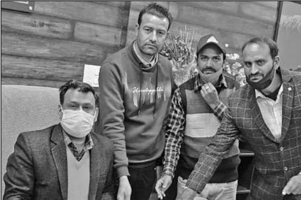
NOPRUF delegation handing-over memorandum to DC Doda.