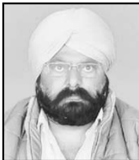
S. Tarlochan Singh