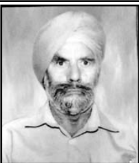
Late S. Kirpal Singh