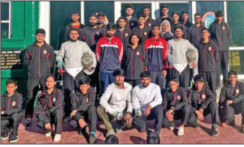
Fencers participating in camp posing for a photograph.