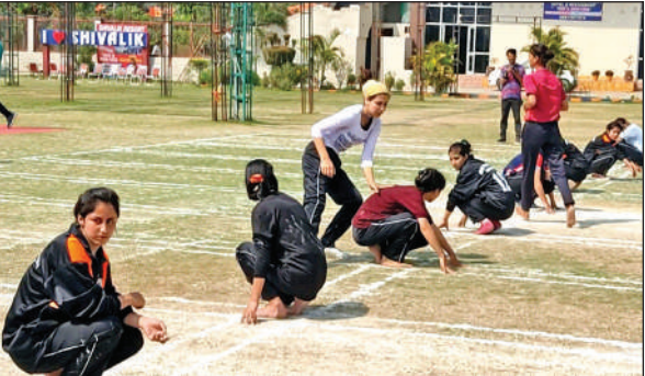
A Kho-Kho match in progress.