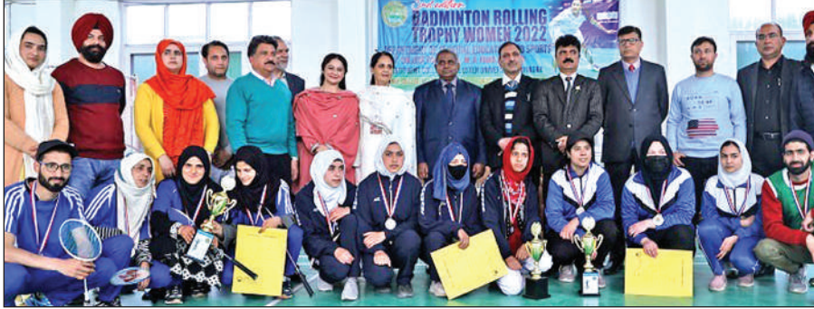
Winners posing for a photograph with dignitaries.

Vice Chancellor, Cluster University Srinagar, Prof.