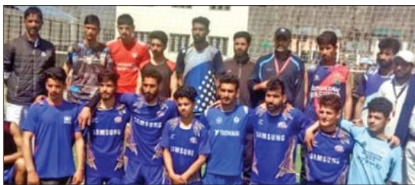
Teams posing for a photograph with officials.

The officials informed that the winning teams of inter block competition will participate in inter district level at Jammu on 28th of this month.