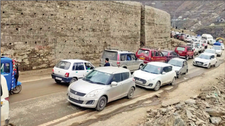
Vehicles plying on National highway after its restoration.