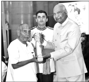
President Ram Nath Kovind presenting Padma Shri to 125-year-old Yoga Guru Swami Sivananda.