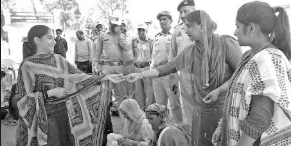
Training being imparted to women at Nowshera.