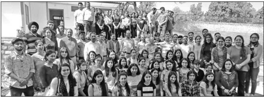
Faculty along with students during the programme at Akhnoor.

Heritage walk covered Chandian Park, Parshuram