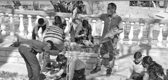
Volunteers carrying out cleanliness drive.