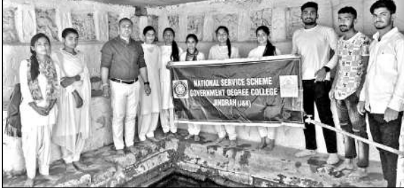
Faculty along with NSS volunteers during the drive.