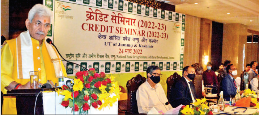
LG Manoj Sinha addressing gathering after unveiling Potential Linked Credit Plan of NABARD for J&K UT.

LG unveils NABARD's Rs 34,829 Cr Potential Linked Credit Plan for J&K