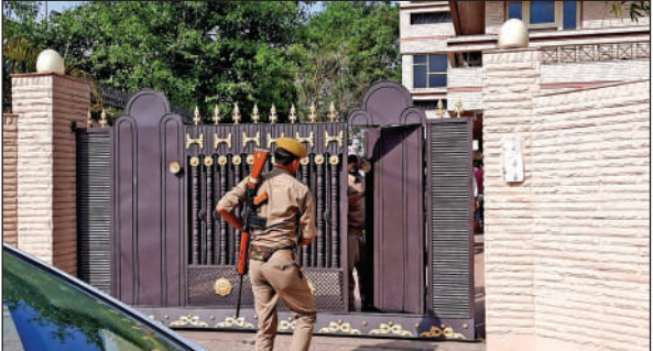
ED's raid going-on in a house at Jammu on Thursday.