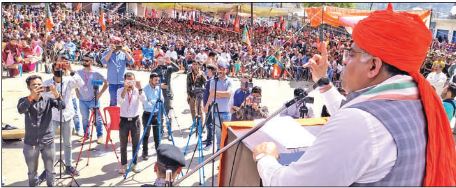
BJP National General Secretary, Tarun Chugh addressing public rally at Doda.

Tarun Chugh, while addressing the gathering, enumerated various development works initiated by the Modi government in District Doda said that under the guidance of Prime Minister