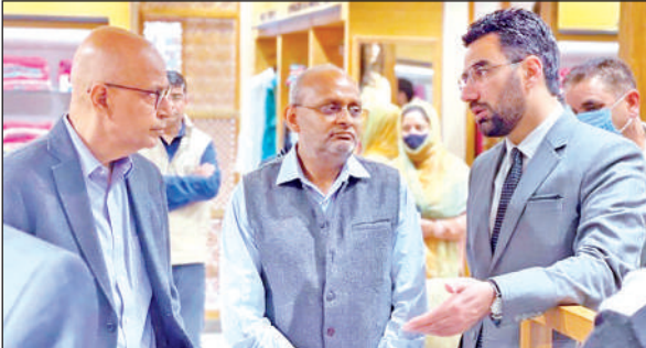
Team members of the World Bank interacting with official.

Domala siphon in Chhiniya Panchayat DDC members alongwith all Sarpanches, Panches and political workers, he found that repair work of said siphon is still pending for one and half year ago, under this siphon three Panchayats including Chhiniya, Treva and