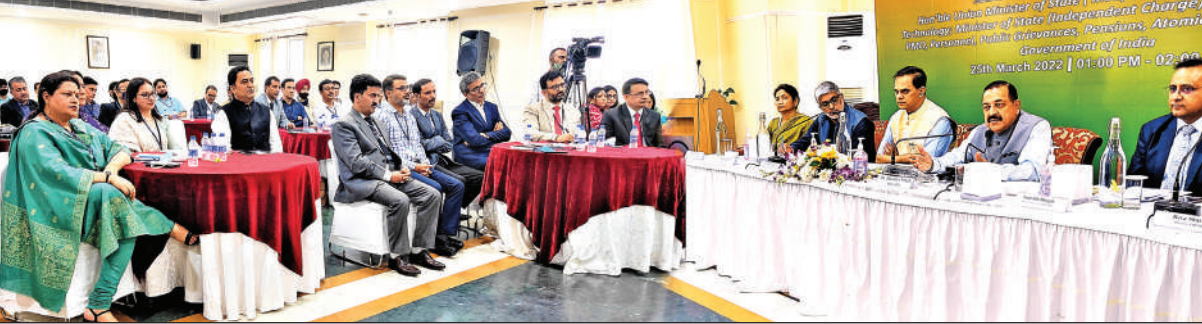
Union Minister Dr Jitendra Singh interacting with senior JKAS officers undergoing the 3rd Capacity Building Programme conducted by the Department of Administrative Reforms, at New Delhi on Friday.

NEW DELHI: Addressing the valedictory function of the 3rd Capacity Building Programme for senior officers of Jammu & Kashmir Administrative Service (JKAS) here today, Union Minister, Dr. Jitendra Singh said that under Prime Minister Narendra Modi, the Union Ministry of Personnel (DoPT/ DARPG) has sought to introduce a new outlook in