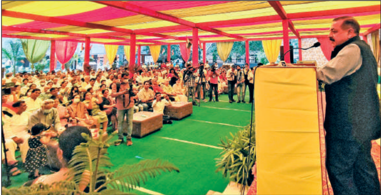
Union Minister Dr Jitendra Singh addressing a gathering of displaced Kashmiri Pandit community after formally naming a Govt School after Shaheed Tika Lal Taploo, at Rohini, New Delhi, on Sunday.

Dr Jitendra Singh said, he and several other youth activists of his gener-