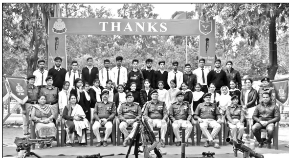
SSB officials along with students during the event.