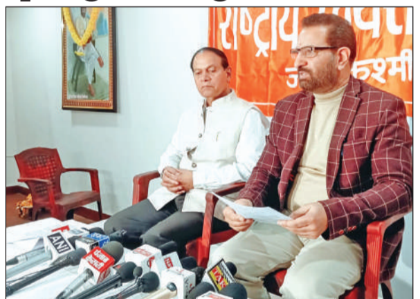
Rashtriya Swayamsevak Sangh J&K members talking to reporters.

STATE TIMES NEWS JAMMU: Stating that while many countries have respect and goodwill towards India, the Jammu and Kashmir unit of Rashtriya Swayamsevak Sangh on Saturday some powers of the world are not able to accept this 'self' based resurgence of India.