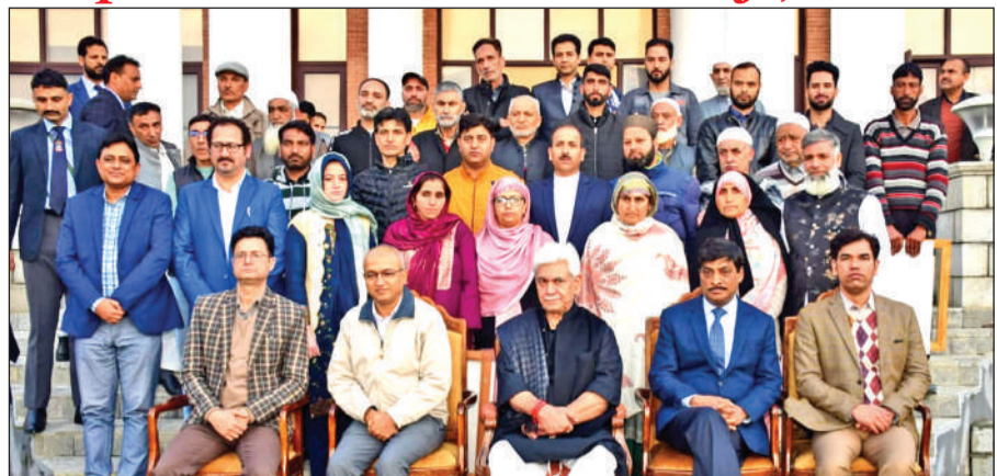
Lt Governor Manoj Sinha after presenting the UT Level Awards to the Artisans at Raj Bhavan auditorium on Saturday.

STATE TIMES NEWS SRINAGAR: Lieutenant Governor Manoj Sinha presented the UT Level Award to the Artisans at Raj Bhavan auditorium on Saturday.