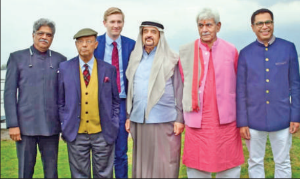
Lieutenant Governor Manoj Sinha along with members of UAE- India- Business Council at Srinagar.

"We have been successful in removing the impediments and hurdles to great extent. We are upgrading our infrastructure both in capacity and quality to meet new demands and ready to raise our partnership with industries to higher levels," the Lt Governor said. The path of reforms that we have embarked upon in the last three years is the outcome of a well-considered long-term comprehensive strategy to provide a conducive investment climate for domestic and for-