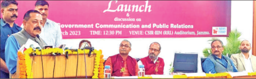
Union Minister Dr Jitendra Singh launching J&K Chapter of Public Relations Society of India (PRSI) in Jammu on Sunday.