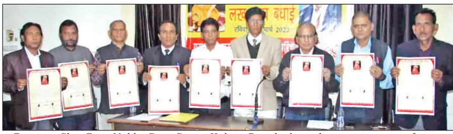
Goswami Shri Guru Nabha Dass Samai Kalvan Parishad members at a press conference.