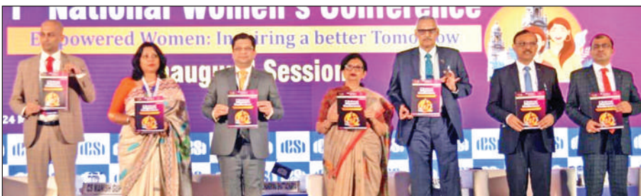
MoS H&FW West Bengal, Chandrima Bhattacharya along with ICSI officers at first National Women's Conference.

■ STATE TIMES NEWS KOLKATA: The first National Women's Conference of the Institute of Company Secretaries of India (ICSI) was inaugurated by Chandrima Bhattacharya, Minister of State (Independent Charge) for Finance & Programme Monitoring and Minister of State for Health & Family Welfare Government of West Bengal, in Kolkata today. The theme of the two-day National Women's Conference, Empowered