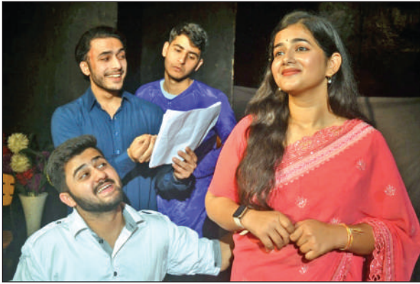
Natrang artists performing in a play.