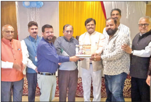
BVP J&K Prant members during a meeting.