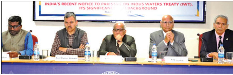
Dignitaries at a seminar held at IIPA J&K.