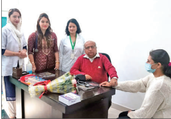
Doctor examining a patient during a camp.