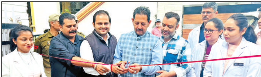
Dy Mayor Jammu, B.S Billawaria inaugurating Ayurvedic Medical Aid Camp.