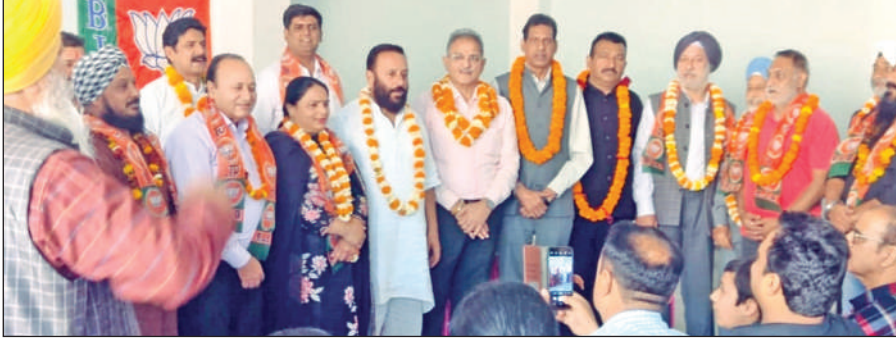
Senior BJP leader, Kavinder Gupta welcoming newly joined members in Jammu.