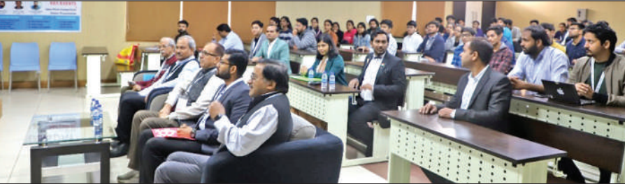
Dignitaries at IIT Jammu during celebration of Chemical Engineering Day.