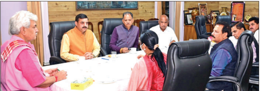
DDCs Chairpersons from Jammu Division calling on Lieutenant Governor Manoj Sinha.