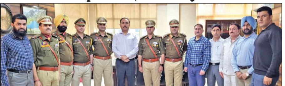
ADGP Security posing with newly decorated Inspectors and others during pipping ceremony.