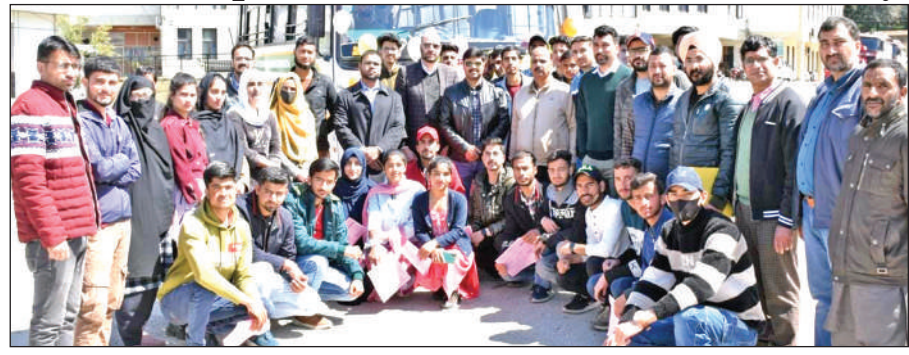
DC Kishtwar with students and others during flagging-off ceremony.