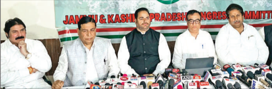
Senior Congress leader Ajay Maken addressing a press conference in Jammu on Tuesday.