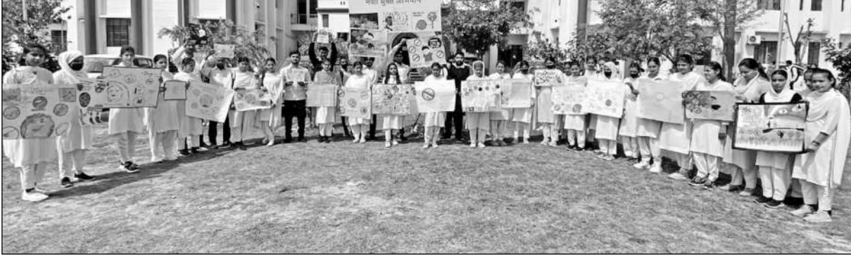
Faculty along with students during the event.

The students of the college beautifully designed and created many colorful posters on the related