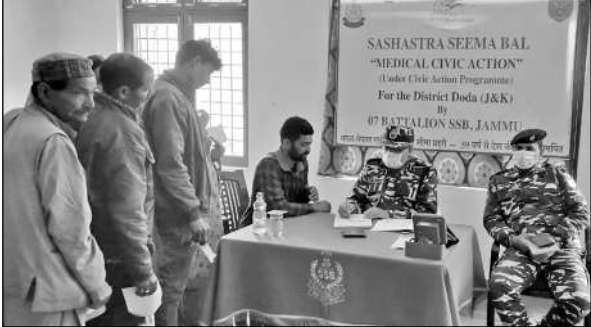
People being examined during the camp.