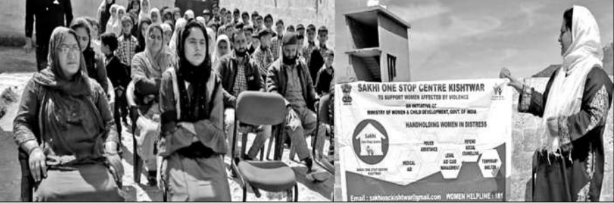
A resource person educating womenfolk.