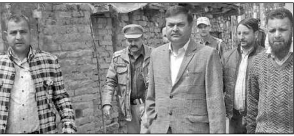
A team of administration during the market inspection.