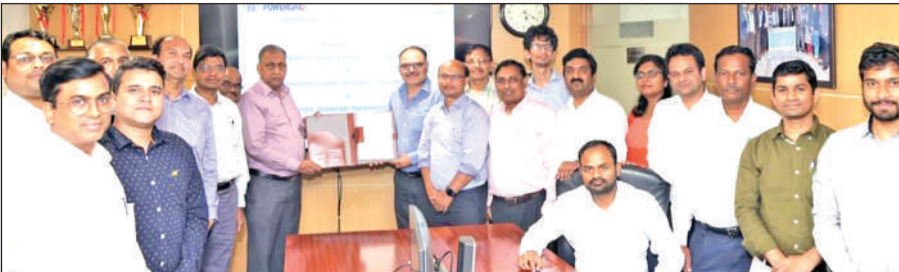
PGCIL acquiring three Special Purpose Vehicles (SPVs) for various Transmission System Projects.