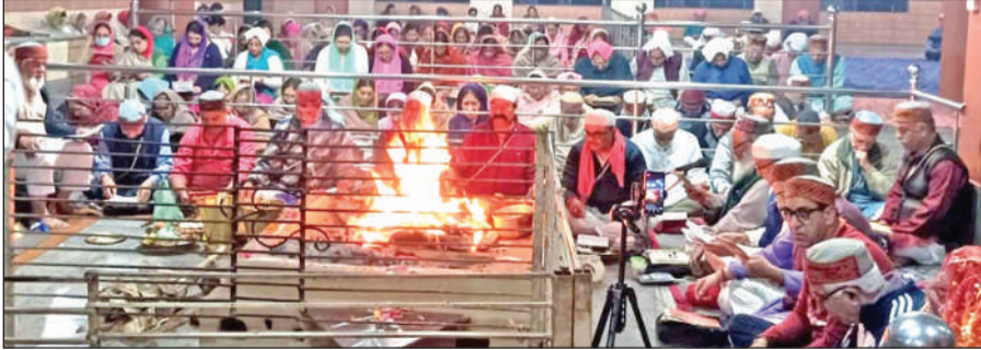
Devotees performing Hawan at Bhagawan Gopinath Ashram in Jammu.