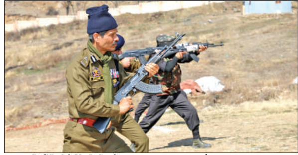
DGP J&K, R.R. Swain in action at firing range at Commando Training Centre Lethpora.

the criminals while protecting and helping the innocent. Those who try to disturb the people are the stumbling blocks which need to be removed. We have to take tough actions against such