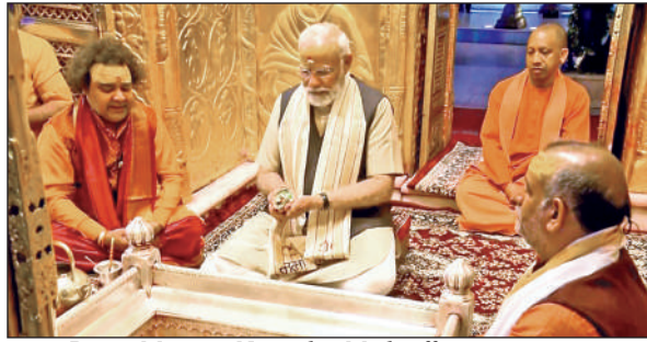
Prime Minister Narendra Modi offering prayer at Kashi Vishwanath Temple.

Chief Minister Yogi Adityanath, senior party leaders and office bearers