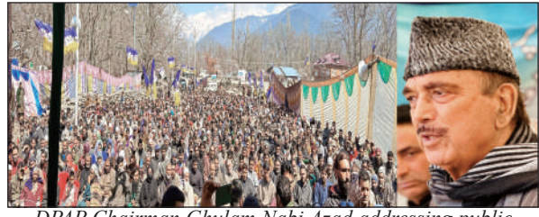
DPAP Chairman Ghulam Nabi Azad addressing public meeting in Chittergul area of Anantnag district.

"We have been waiting for the Assembly polls for years. We hope that the polls take place immediately after the parliamentary election. I think the people of Jammu