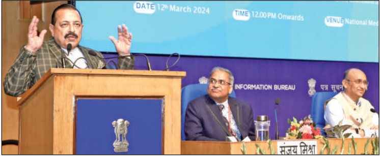
Union Minister Dr. Jitendra Singh speaking after launching "Common Fellowship Portal" at National Media Centre, New Delhi on Tuesday.

He added that this portal will enable a simplified and streamlined process from the submission of application forms for selection. The applicants can create their profile on the portal and use the same information to auto-fill different applications. Thus, this Portal will help all applicants by reducing their time and energy by