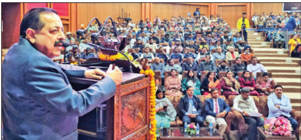
Union Minister Dr. Jitendra Singh speaking at the launch of Pradhan Mantri Samajik Uththan evam Rozgar Adharit Jankalyan (PM-SURAJ) National Portal via video conferencing at Convention Centre, Jammu on Wednesday.

citizen is now feeling confident enough to have every facility available to another person and the confidence to reach the highest position by dint of his or her effort. "Prime Minister, Narendra Modi-led NDA Government unveiled scheme after scheme in the last ten years, with the sole motto of reaching the last person in the queue, rising above the narrow considerations of caste, religion