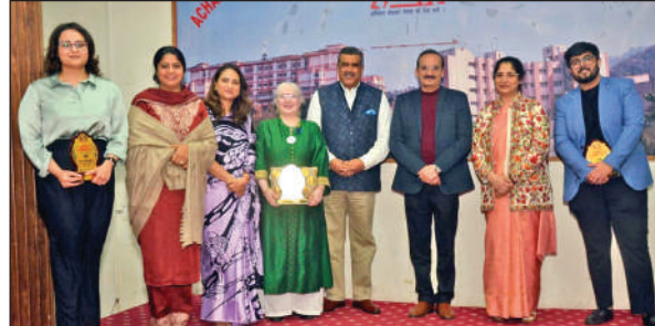
Retina Specialists along with Principal ASCOMS at an event.