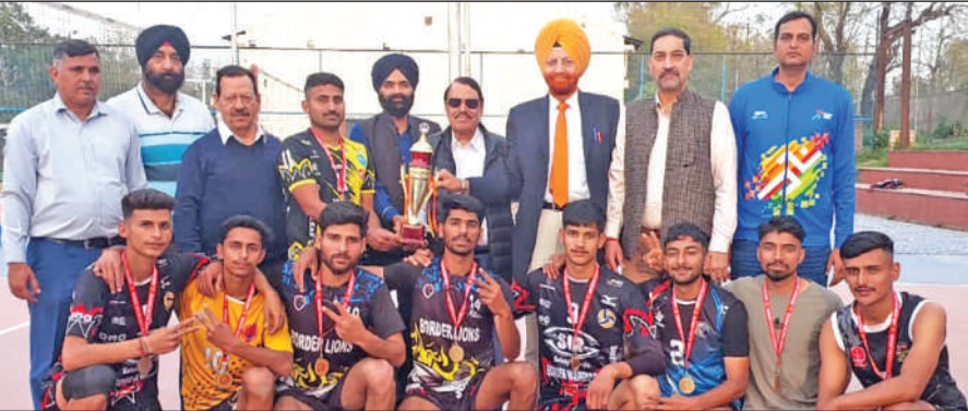
Border Lions Volleyball Club Pallanwala team receiving winner trophy.