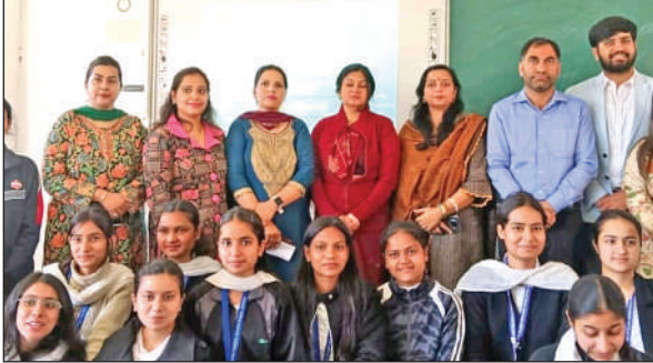
CUJ and PSPS GCW Gandhi Nagar faculty and students at a programme.

Guest of the inaugural session, emphasized the importance of adapting to evolving industry trends and leveraging social media as a powerful tool for communication and outreach.