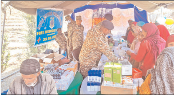
CRPF men distributing medicines among locals.