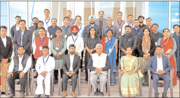
Faculty members along with participants.