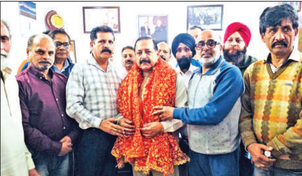
Union Minister Dr. Jitendra Singh with different groups of citizens calling at his parliamentary office at Jammu.

It is not only the BJP worker appealing for 400 plus mandate, but the common citizen of India who wants a third term for Narendra Modi to lead India on the path to "Viksit Bharat", he said. The Union Minister Dr Jitendra Singh was interacting with media on the sidelines of a series of meetings with groups of citizens from all walks of life at his parliamentary office here. In the last two terms Prime Minister Narendra Modi has emerged as the tallest leader today, his word is heard with respect and awe by Heads of