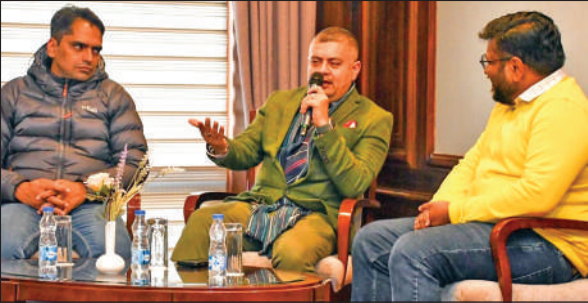
Secretary-cum-Transport Commissioner Amit Sharma speaking in a workshop.

■ STATE TIMES NEWS LEH: In yet another first-of-its-kind initiative in Union Territory of Ladakh, UT Transport Department led by Secretary-cum-Transport Commissioner Amit Sharma, organised a Half-Day Workshop today to deliberate upon and brainstorm amongst all the stakeholders of Transport Sector towards promoting the usage of freight vehicles on EV (Zero Emission Vehicles) in the Union Territory of Ladakh with the objective to make it first carbon neutral state/UT of the nation.