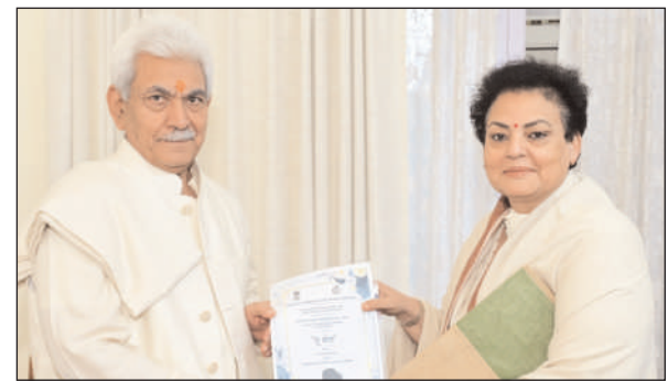
Chairperson NCW, Rekha Sharma calling on LG Manoj Sinha.