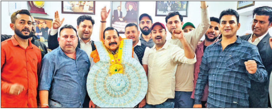
Union Minister Dr. Jitendra Singh with a delegation of youth during the campaign trail on Wednesday.

He recalled that PM Narendra Modi had in detail explained this success story in farming from district Doda of J&K in his "Mann Ki Baat" broadcast and told the listeners