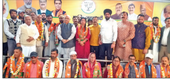
Prominent political and social personalities joining BJP.