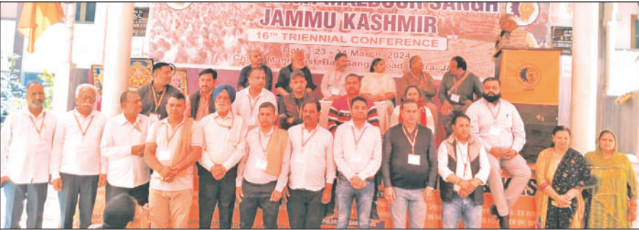
Organisers along with participants during the conference.

KATRA: 16th state triennial conference of Bharatiya Mazdoor Sangh Jammu Kashmir concluded at Chinta mani Trust Katra in which more than two hundred delegates participated. In the conference six regulations were passed i.e. Minimum wages linking with consumer price Index in Jammu Kashmir; Social security to daily wagers and regularization of daily wagers in phase manner; Implementations of Labour laws in accordance with statutory provisions of laws; providing status of industry to private sector transport and stoppage of personal vehicle on contract system; Enhancing honorarium of Aganvadi workers and social security cover to angan wadi workers; Preference to locals