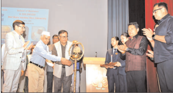
Dignitary lighting the ceremonial lamp.