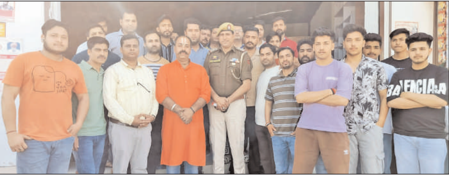
Police officer along with locals during the event.

BISHNAH: Under operation Pathshala, a program was organized for youth of Bishnah to spread awareness on the menace of drugs in society and role of police