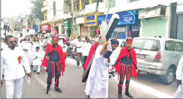
Peace procession taking out in Jammu.

Jammu city and around participated in the rally with