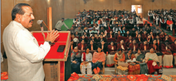
Union Minister Dr. Jitendra Singh addressing "Intellectuals Meet" organised by BJP at Amethi, UP on Saturday.

Transformation came in 2019 when BJP candidate Smriti Irani got elected and meanwhile there was also a double engine government in Uttar Pradesh in the form of Yogi Adityanath as Chief