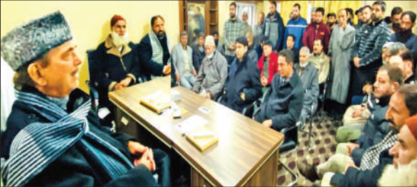
Chairman DPAP, G.N Azad interacting with deputations.

SRINAGAR: Ghulam Nabi Azad, Chairman Democratic Progressive Azad Party (DPAP), on Saturday expressed deep concern over the widespread damage inflicted upon hundreds of houses and livestock sheds across various hamlets in Reasi, Anantnag, Kulgam, Shopian, Doda, Kishtwar, Ramban, Rajouri, and Poonch districts due to gusty winds, heavy rainfall and snow. Azad urged the Lieutenant Governor's administration to assess the damage caused by heavy rains and pay adequate compensation to victims. The adverse weather conditions have not only caused significant damage to residential structures but have also led to disruptions in electricity and water supply, as well as severed surface connectivity in the upper reaches of Pir Panjal, Chenab, and parts of South Kashmir, he said. Azad emphasized the urgent need for the administration to promptly reach out to the affected communities with adequate relief and compensation. He called for the swift deployment of teams at the district level to assess the extent of the losses incurred by the victims. He emphasized the government's responsibility to ensure the clearance of roads in snow bond areas, as the lack of accessibility hinders patients from reaching hospitals in a timely manner.