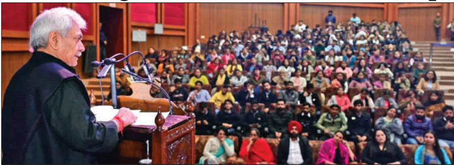
Lt Governor Manoj Sinha addressing the NCW event at Convention Centre.

He commended the endeavour of the National