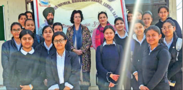
NSS volunteers and faculty of GCW Bhagwati Nagar during plantation drive campaign in the college premises.

■ STATE TIMES NEWS JAMMU: NSS wing of GCW Bhagwati Nagar organized a plantation drive campaign in the college premises. The Programme was organized under the guidance of Principal Dr. Meeru Abrol. Students planted different