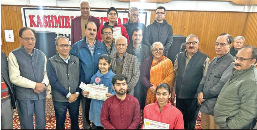
KPS Jammu members with students during "Haerath Milan" function on Saturday.