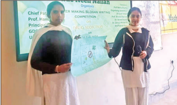
GDC Neeli Nallah students during a competition on Saturday.