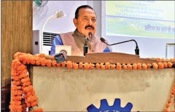
Union Minister Dr Jitendra Singh addressing members of civil society organisations.

He said PM Narendra Modi had devoted a substantial slot in his "Mann Ki Baat" broadcast to describe the virtues of lavender farming undertaken in Bhaderwah. The Minister said, the geography and climatic conditions of these States favour the cultivation of medicinal and aromatic plants and these can be developed into Agri-tech StartUp enterprises. This is especially relevant given the recent interest in medicinal plants in fol-