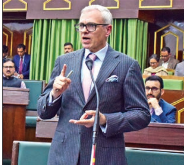
CM Omar Abdullah speaking during the J&K Assembly session in Jammu on Monday.

during the event hurt public sentiments, a concern that he acknowledged as both understandable and justified.