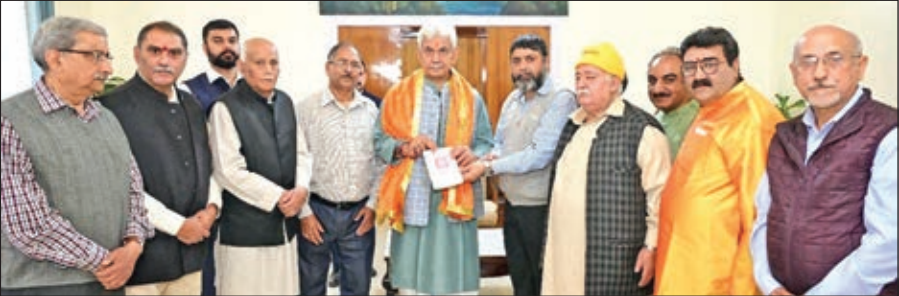
Delegation of managing committee of Shri Shri Jagat Amba Sharika Chakreshwar Sanastha Trust calling on LG Manoj Sinha in Jammu on Tuesday.

As a mark of reverence, the delegation presented the Lieutenant Governor with a bouquet of flowers and the sacred Dhyan of Syumbu Shreechakra, an inscription from the temple. In addition, books of various Shastras recited