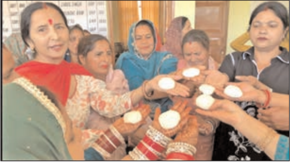
Participants during the training.