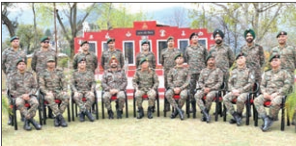
GOC White Knight Corps, Lieutenant General Navin Sachdeva during visit to Rajouri.