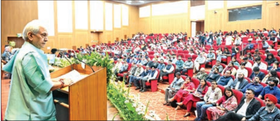
LG Manoj Sinha speaking at the NITI Aayog's workshop at IIM Jammu on Wednesday.

The Lieutenant Governor said, such deliberation on reforms to create growth environment will have a wide-ranging impact on Micro, Small, and Medium Enterprises in the Union Territory of India. He emphasised that the Communication between all