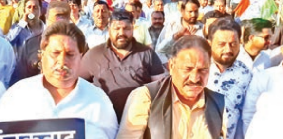
Congress leaders taking out protest rally.