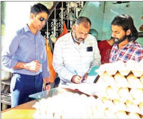
JMC officials carrying out drive.