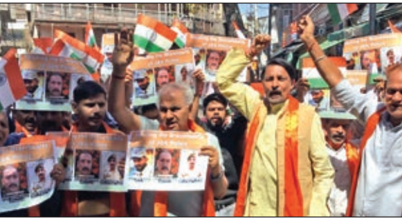
DFSS activists staging protest in Jammu.