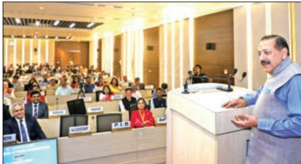
Union Minister and Chairman IIPA, Dr. Jitendra Singh delivering Keynote address at the 71st Foundation Day of IIPA at New Delhi on Saturday.

He highlighted his Ministry's responsibility in bringing governance closer