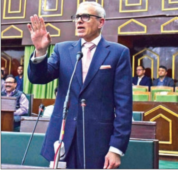
CM Omar Abdullah replying to a question in Legislative Assembly on Tuesday.

"The department is actively working on developing the Jammu pilgrimage circuit. I have repeatedly emphasized this to more than one crore Mata Vaishno Devi pilgrims. If even ten to fifteen percent of them can be encouraged to visit other tourist destinations in Jammu, it will significantly benefit the region. However, we have not been able to achieve this so far," he