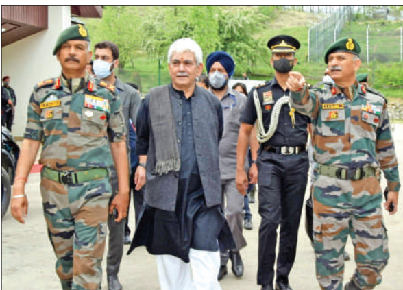
LG Manoj Sinha accompanied by senior officers of army during visit to Chinar Corps in Pattan, Baramulla.

■ STATE TIMES NEWS BARAMULLA: Lieutenant Governor Manoj Sinha on Saturday called for foiling underground as well as over-ground extremist ideological campaigns, which are involved in misleading youth in Jammu and Kashmir. "Young people and entire community have a huge responsibility to isolate and expose those justifying or condoning terrorism", the Lt Governor stressed while addressing hundreds of enthusiastic youths, citizens of North Kashmir at the "Sahi Raasta" programme organized by the Chinar Corps in Pattan, Baramulla. Sinha said that Young minds have an instinctive attraction to ideals of peace, selfless service, and progress of the society. And the J&K administration has taken many steps to create supportive infrastructure, schemes and policies to meet