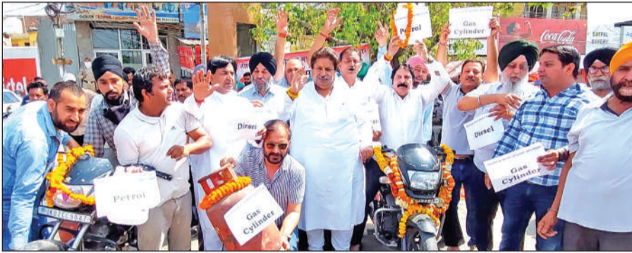
Congress leaders during a protest at Jammu.

protest against the Modi government for its alleged "anti-people" policies. They also offered garlands on bikes and vehicles as symbolic gesture signifying the 'death' of transport due to extremely high prices of fuel.