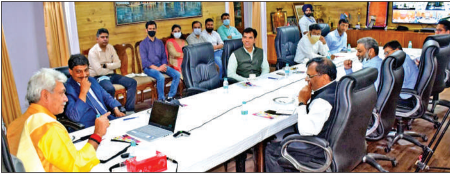
Lt Governor Manoj Sinha chairing a meeting during launch of G2C Services.

The Lt Governor also launched dedicated revenue helpline and IEC videos of Revenue Department for effective implementation of