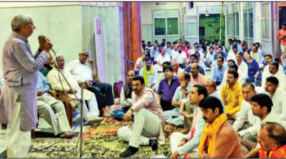
Former Minister Sham Lal Sharma speaking at a programme.